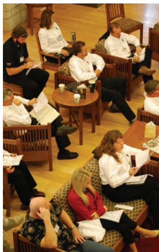
NCLI COHORT 6 FELLOWS