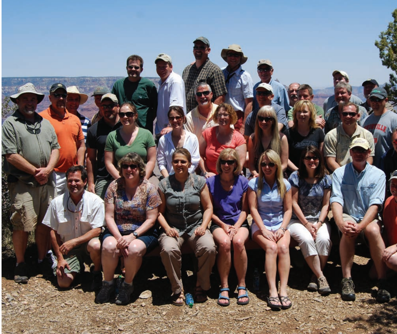
COHORT 6 AT THE GRAND CANYON