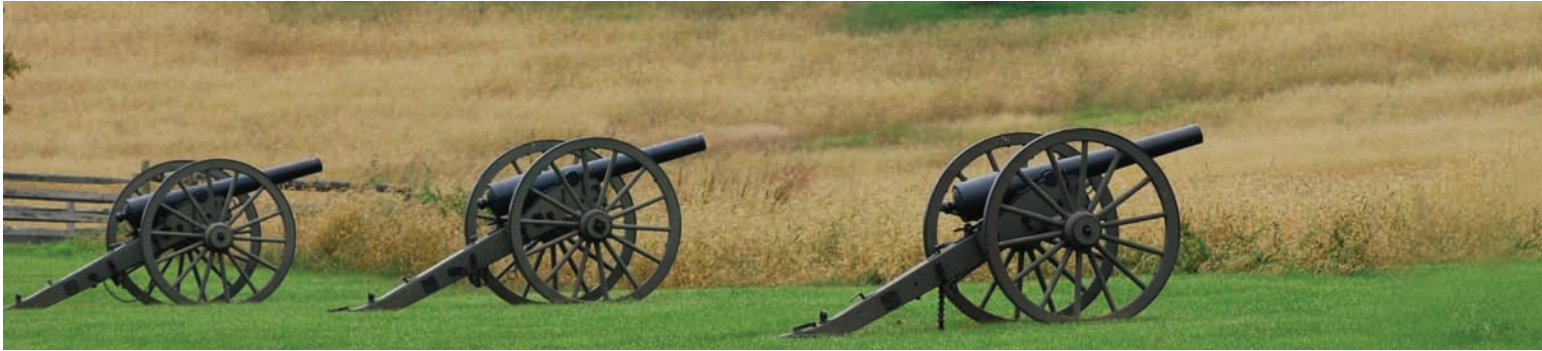
CANNONS AT ANTIETAM BATTLEFIELD