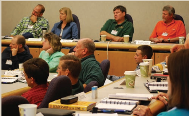
NCLI COHORT 6 FELLOWS