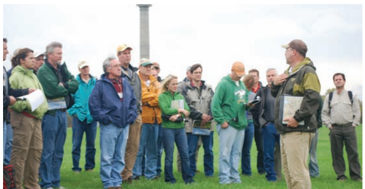
NCLI COHORT 6 FELLOWS LEARN LEADERSHIP LESSONS AT ANTETAM BATTLEFIELD